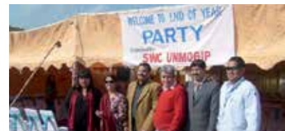
Some of the SWC committee members during 2013 End of year party