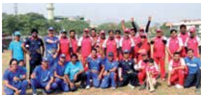
Cricket match with other UN agencies