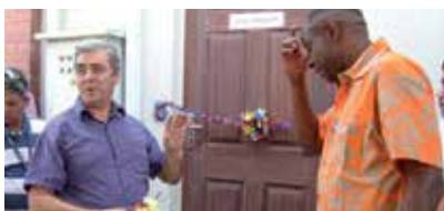
Inauguration SWC Recreation Room "OP-19"