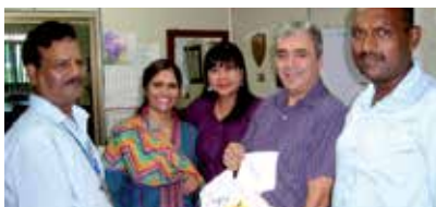
Eid gift-giving to cleaners

and weekly Happy Hours. In 2013 the SWC also re-established the SWC Recreation Room (OP-19) located in the Islamabad HQ. The SWC has also included activities in Srinagar HQ during the opening of HQ last May; refurbishing of the Gym and purchase basic gym equipment. As a Chairman of SWC I have to thank everyone who has been supporting the different activities and especially to all the SWC team, without them nothing could have happened.