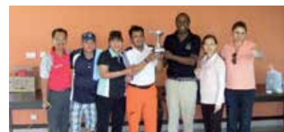
Winners of the UNMOGIP Golf Tournament