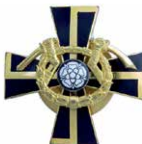
Mannerheim Cross 2 nd Class.