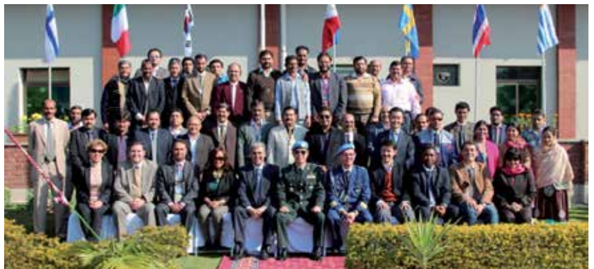
CMO and DCMO with the Civilian Staff November 2013