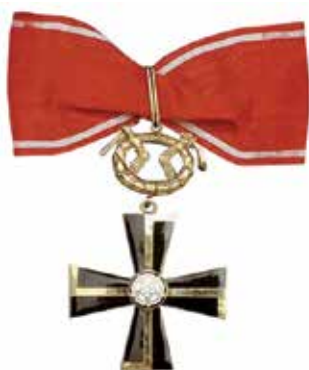
Mannerheim Cross 1 st Class.