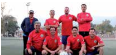
Football match between Military and Civilians