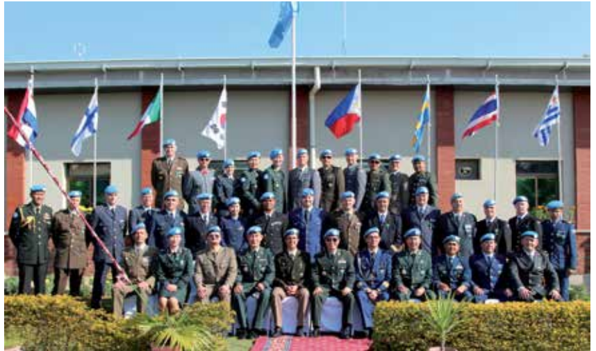
UNMOGIP Military Observers November 2013

The activity is commonly termed as United Nations Military Observers (UNMO) Conference. It is a bi-annual activity that gathers not only all the Military Observers but also includes all the civilian staff in Islamabad Headquarters for a few days of mission-related interactions, information and experience sharing, and opportunities for fellowship with all your UNMOGIP colleagues. It is most significantly designed as a useful venue for the military and civilian staff to discuss and resolve the challenges, issues and concerns of the UNMOs in the conduct of their field tasks. The conference is also being highlighted with the long time tradition of military honors in a Medal Parade Ceremony commemorating the untiring and selfless contributions of all in keeping with UNMOGIP's mandate of maintaining peace between Pakistan and India. The ceremony is attended by all the members of UNMOGIP, high representatives of both India and Pakistan, dignitaries and representatives from all the Troop Contributing Countries