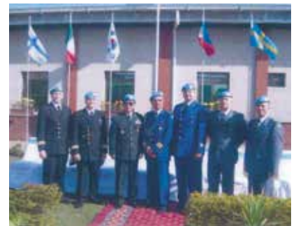
UNMOGIP Finnish Military Observers 2013

Four persons have been awarded it twice. De jure, the decoration is still active and can be awarded to any Finnish soldier, although it is highly unlikely that this would be done during peacetime or even in a minor conflict.