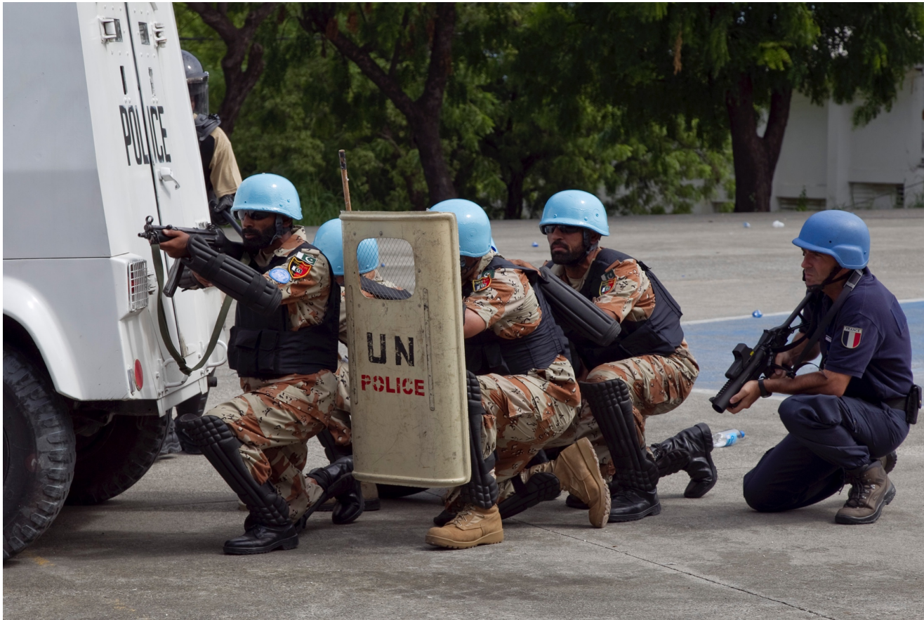
Haitian National Police crowd control section, CIMO, along with United Nations peacekeepers put on a demonstration of crowd control techniques at the graduation of the CIMO officers at the police academy in Port au Prince