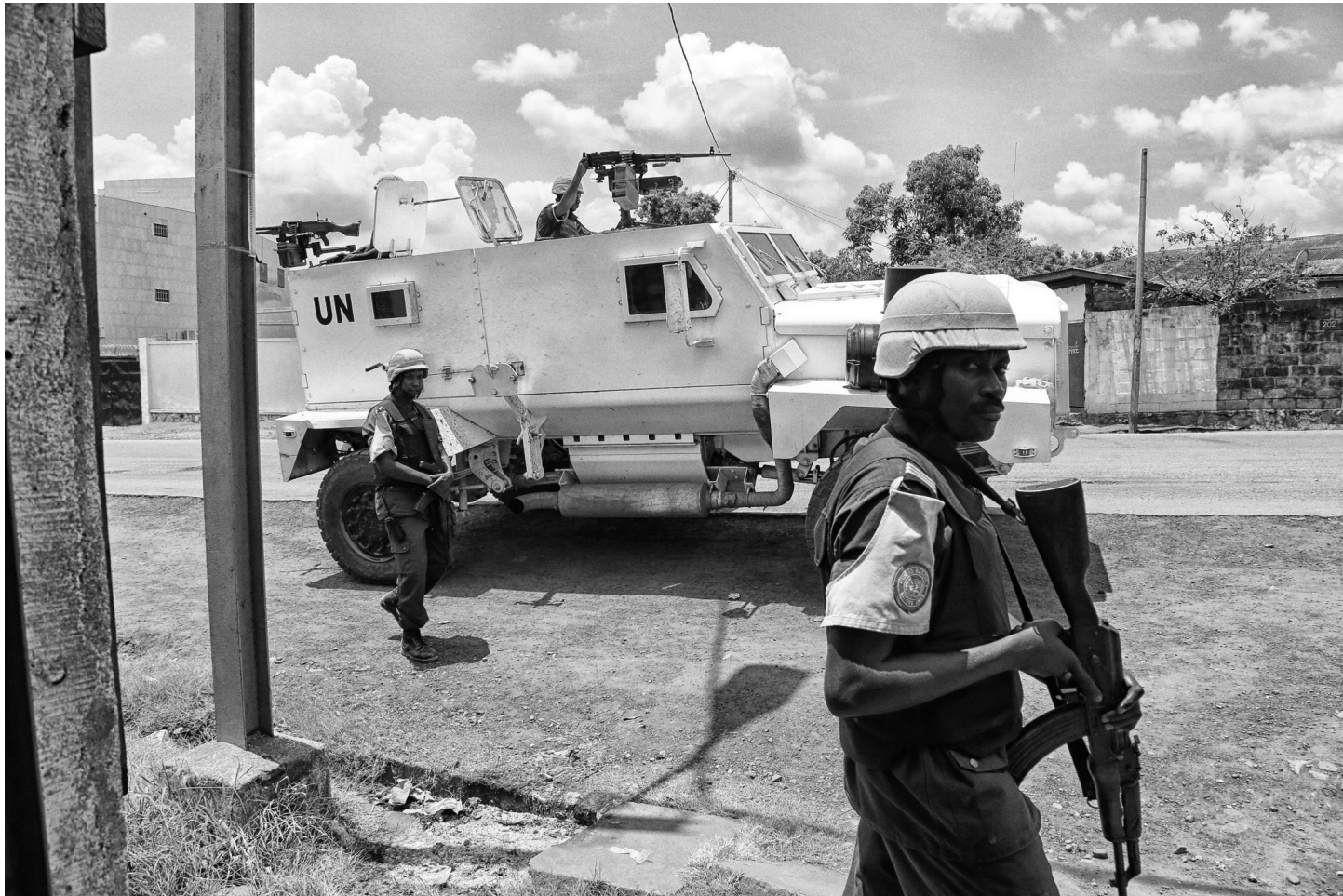
Bangui, Central African Republic, October 2015, one more crisis erupted in the capital city. UNPOL members are patrolling the streets and visiting sites which were looted during the crisis.