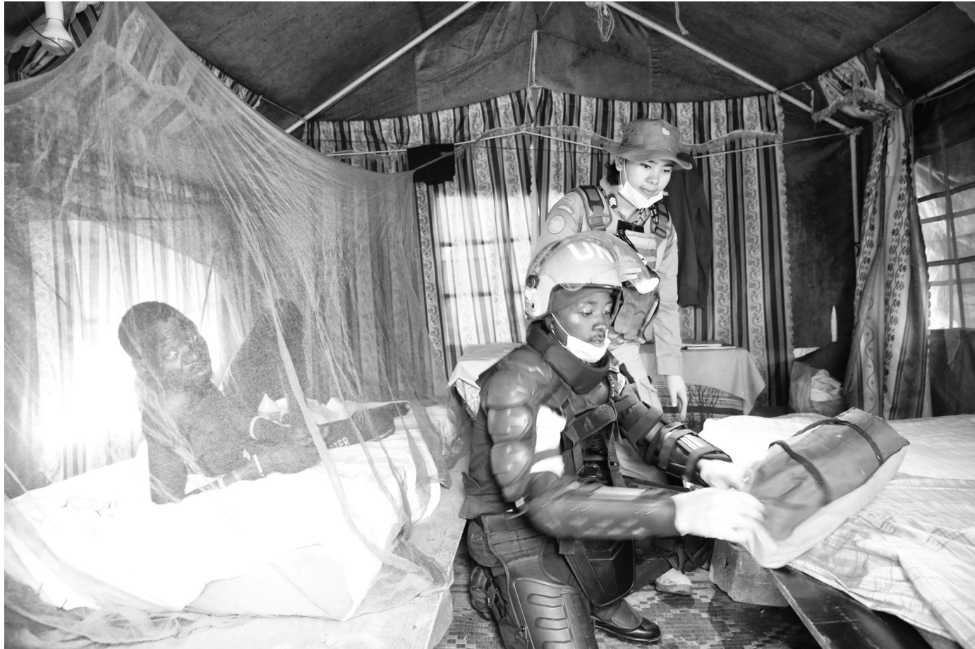
An Indonesian female UNPOL together with a Rwandan FPU member are conducting a search operations in PoC3 in Juba. Search operation are routine operations conducted at least once a month to ensure that no weapons or any other dangerous items are kept inside the protection of civilians camp.