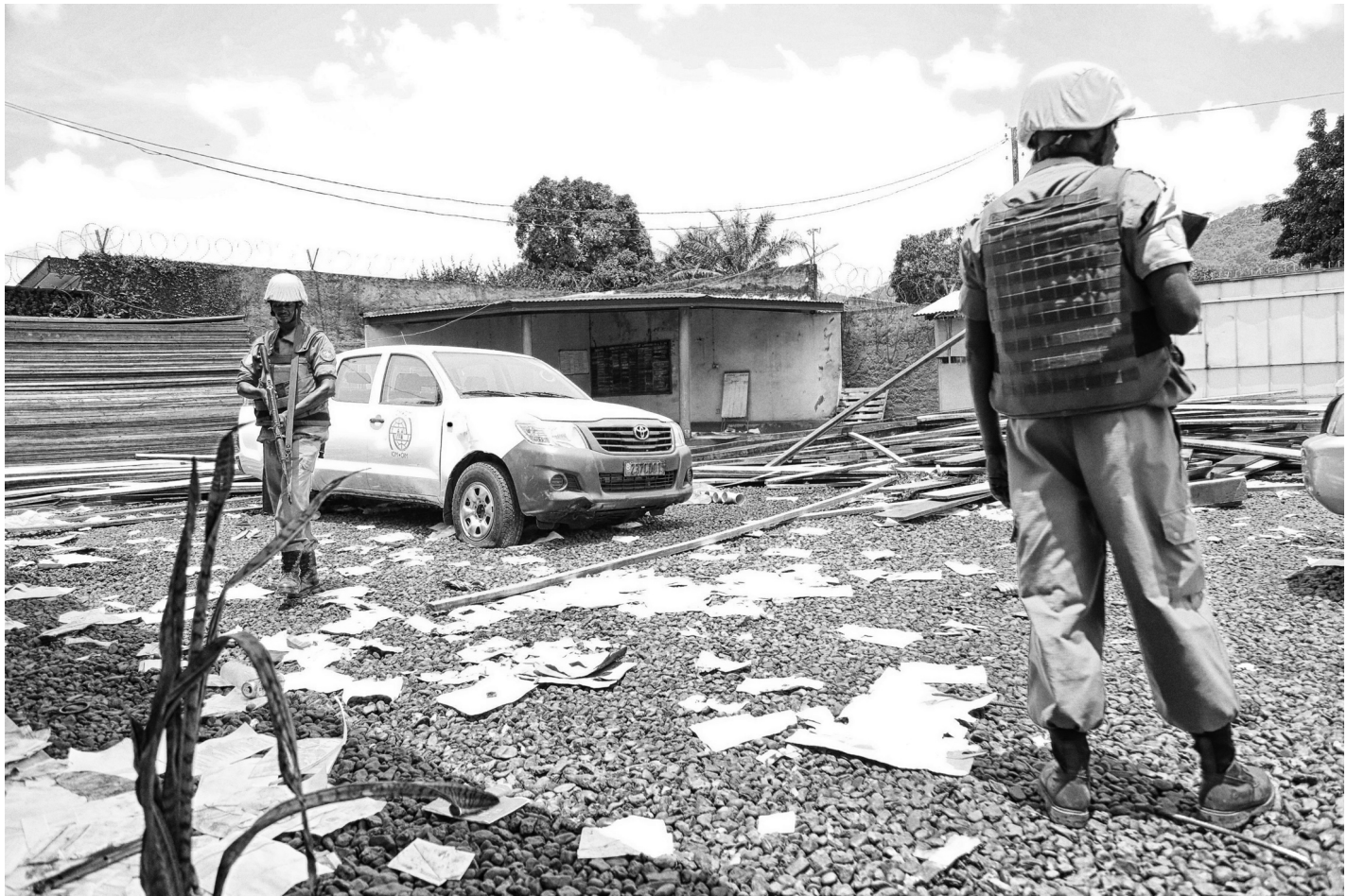
Bangui, Central African Republic, October 2015, one more crisis erupted in the capital city. UNPOL members are patrolling the streets and visiting sites which were looted during the crisis.