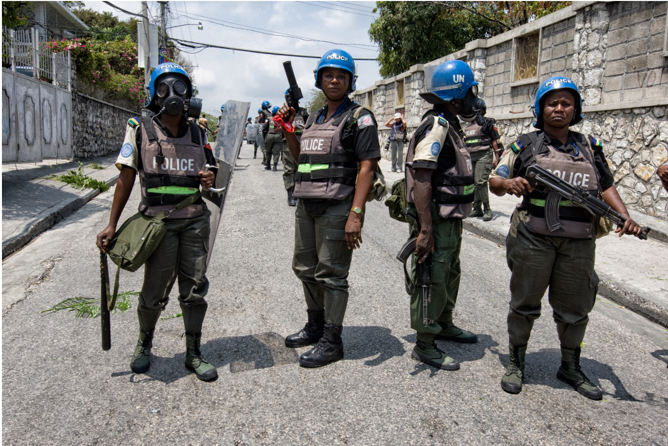
UN peacekeepers clear the road in Port-au-Prince, Haiti, after three days of heavy demonstrations over the high price of food.