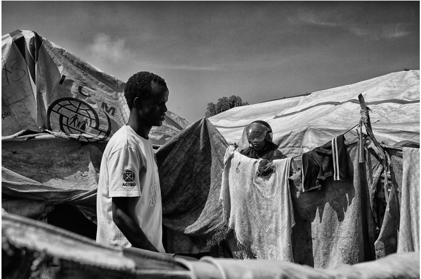
Female members of the Rwandan FPU3 team which consists of 160 members and 50% of whom are women, currently serving in South Sudan, patrolling inside the protection of civilian camp (PoC3) in Juba. Here they provided support for a visit of fellow UN officers to vulnerable women and children living in the PoC