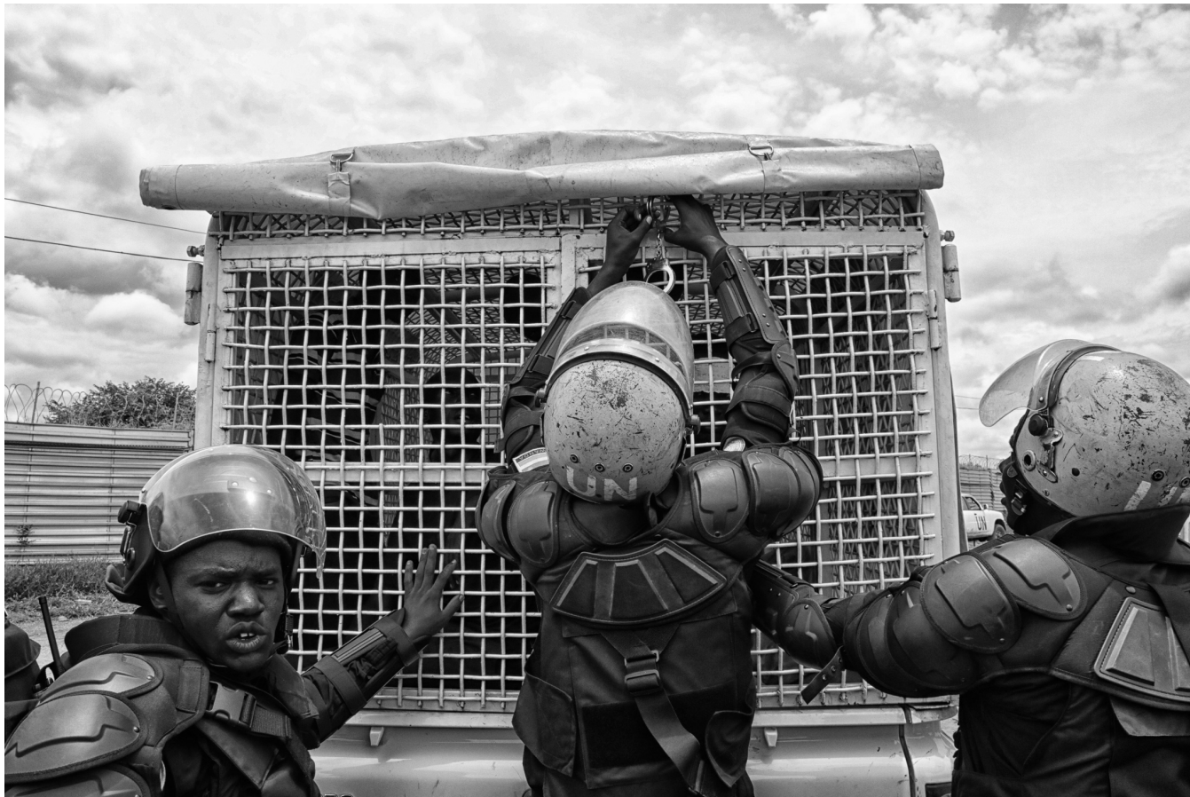
Members of the Rwandan FPU in UNMISS are escorting out of UNMISS' camp (UN House) in Juba, the leaders of the Bul Nuer community. Members of the Bull Nuer community made a sit in protest inside UNMISS' compound, asking UNMISS' assistance to resolve intercommunity disputes in POC3.