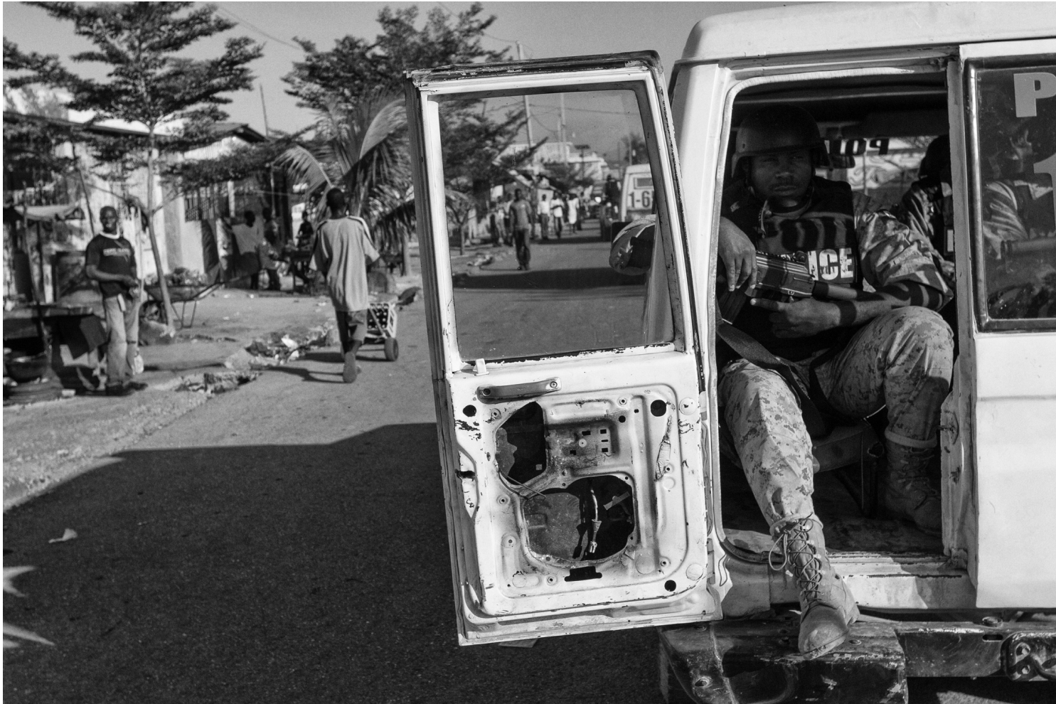
Haitian National Police patrolling the streets of Port-au-Prince. One of UNPOL's responsibilities was to train the Haitian National Police on crowd control techniques.