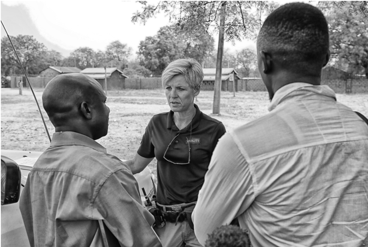
A Norwegian UNPOL Officer serving in South Sudan, is talking with community leaders in Juba's protection of civilians camp (PoC3).