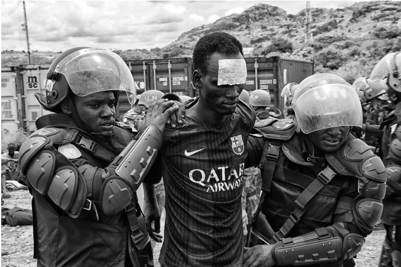
Members of the Rwandan FPU in UNMISS are escorting out of UNMISS' camp (UN House) in Juba, a member of the Bul Nuer community. Members of the Bull Nuer community made a sit in protest inside UNMISS' compound, asking UNMISS' assistance to resolve intercommunity disputes in POC3.