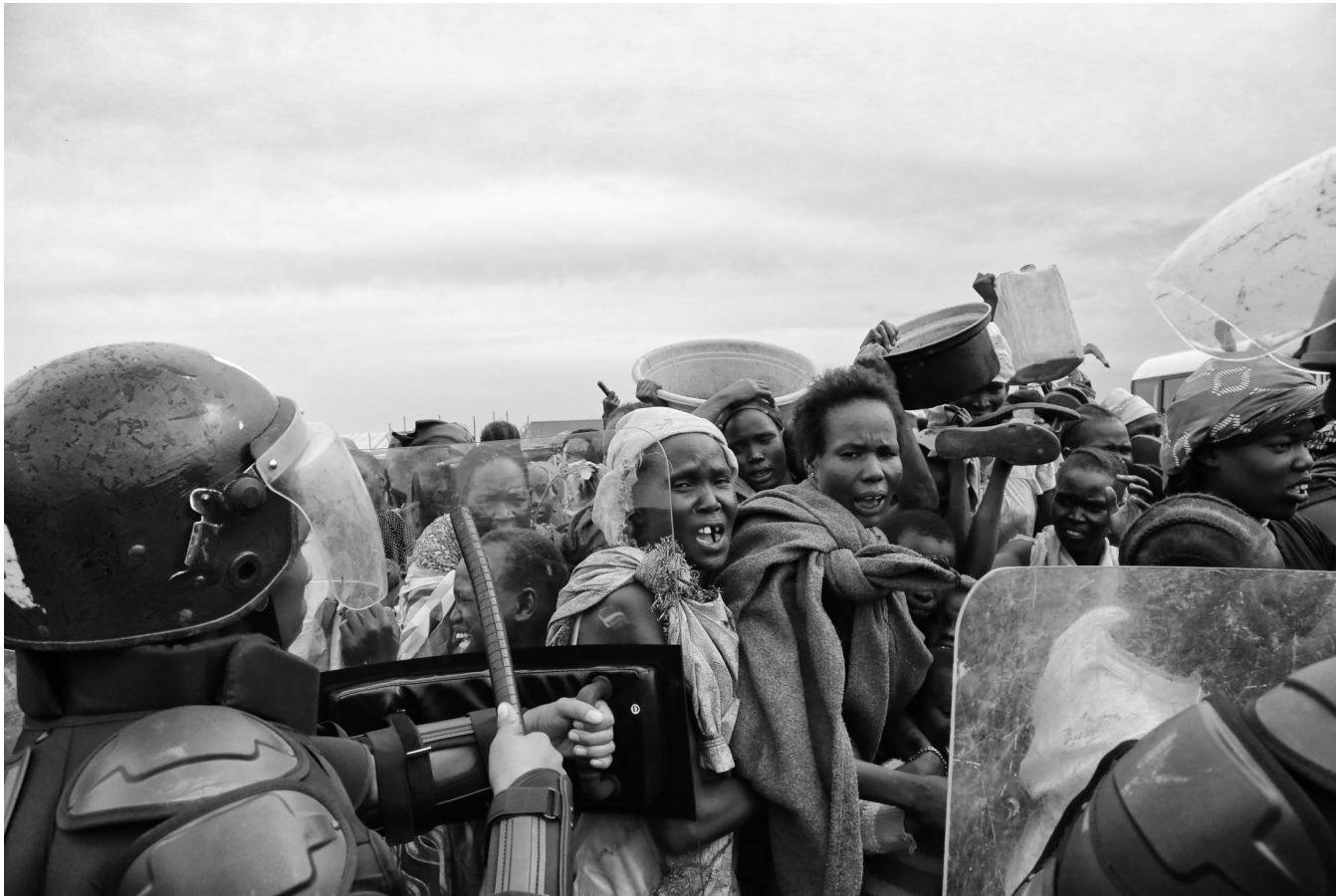
A crowd from PoC3 in Juba gathered in support of Ambassador Haley, during the ambassador's visit in Juba. UNMISS' UNPOL, and in particular Rwandan FPU, was tasked to protect the Ambassador. UNMISS' UNPOL is tasked with protecting the PoC, making sure both residents and visitors are safe.