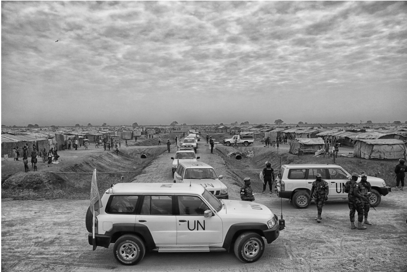
Ghanian UNPOL set a protective perimeter inside Bentiu's Protection of Civilians Camp, during a high level visit