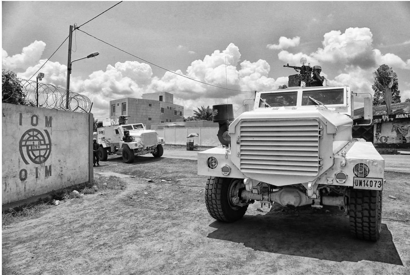
Bangui, Central African Republic, October 2015, one more crisis erupted in the capital city. UNPOL members are patrolling the streets and visiting sites which were looted during the crisis.