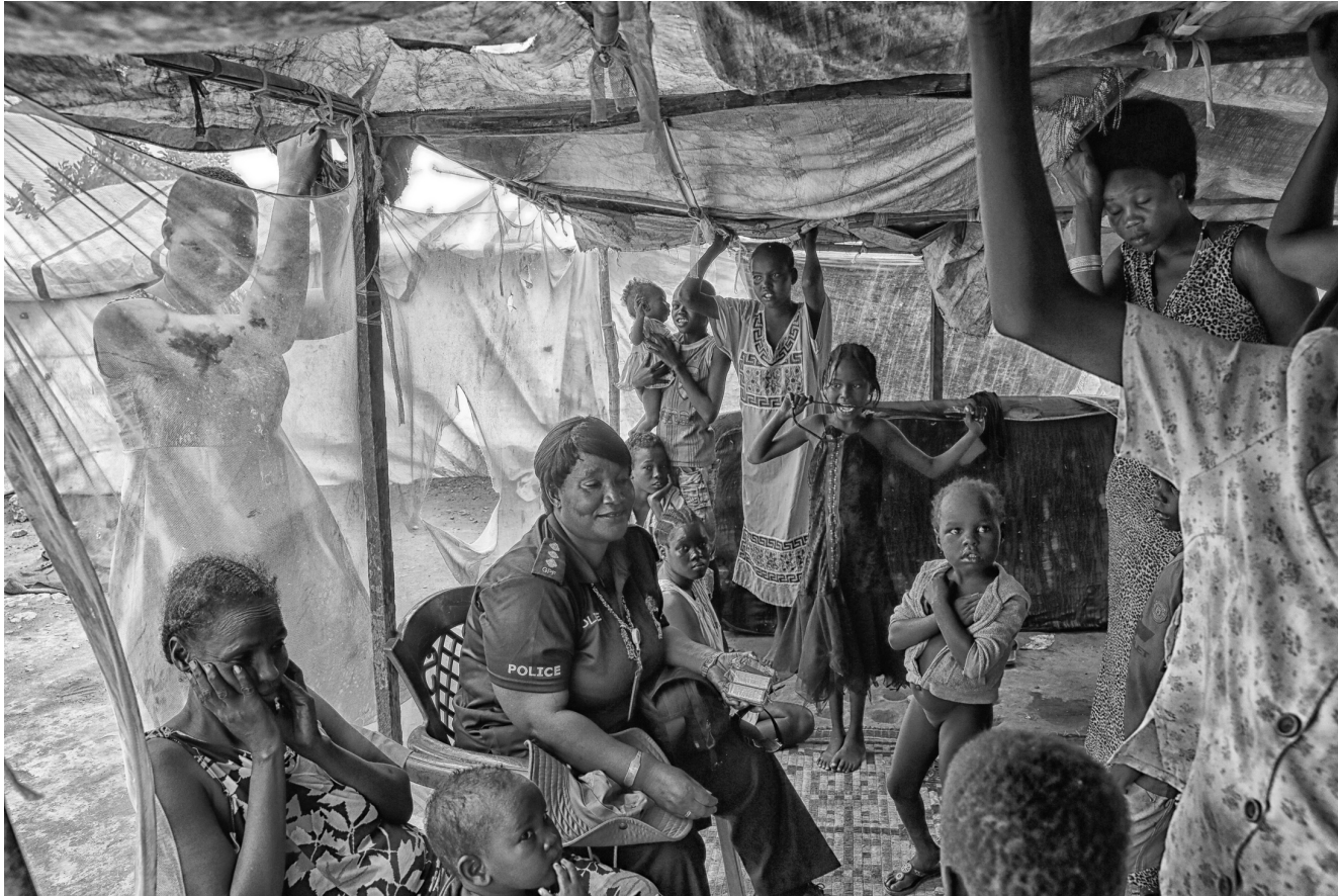
A female police officer from Gambia, meets displaced women in Juba's protection of civilians camp (PoC3). The police officer is a member of the Gender, Children, Vulnerable Persons, Protection Unit (GCVPP). GCVPP has been established to support UNMISS' protection mandate in PoC sites, with a specific attention to Sexual and Gender based Violence.