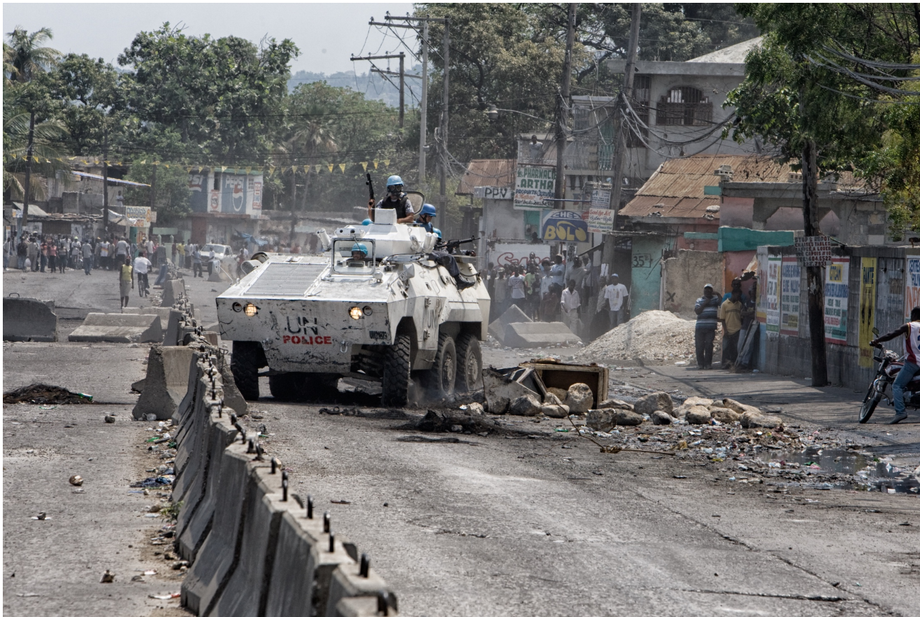
UN peacekeepers clear the road in Port-au-Prince, Haiti, after three days of heavy demonstrations over the high price of food.