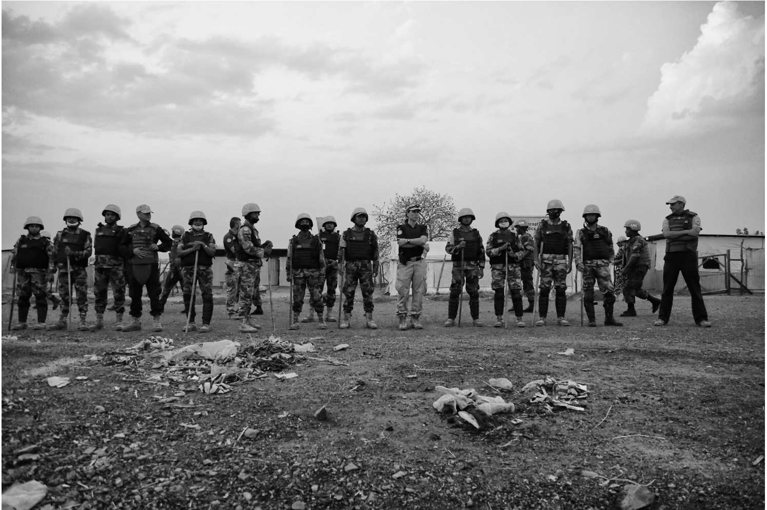
UNPOL officers are conducting a search operation in PoC3 in Juba. Search operations are routine operations conducted at least once a month to ensure that no weapons or any other dangerous items are kept inside the protection of civilians camp.