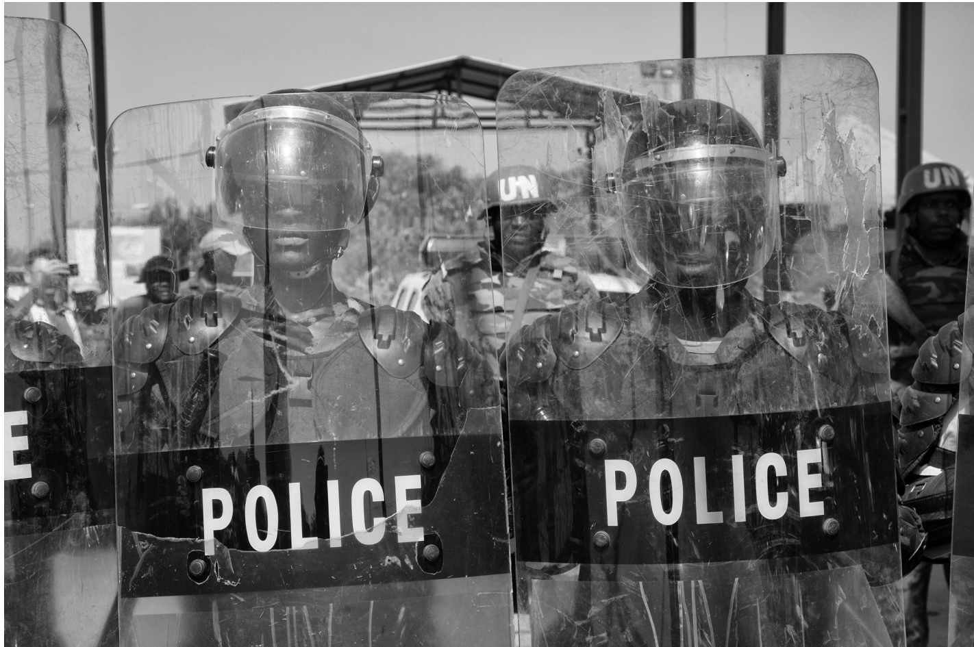
A preparedness exercise by UNPOL in Juba. The exercise took place at UNMISS' Toming camp near Juba's International Airport.