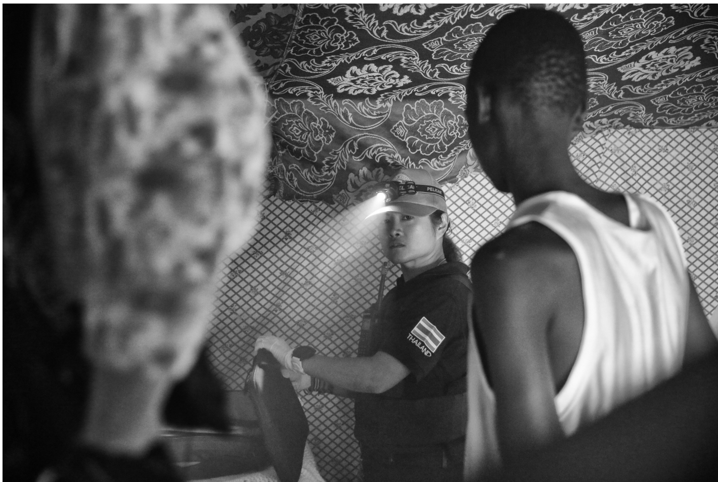
A female police officer from Thailand, during a search operation in the protection of civilians camp in Juba (PoC3), South Sudan. UNMISS, is regularly conducting search operation to ensure that no weapons of any kind are inside the camps.