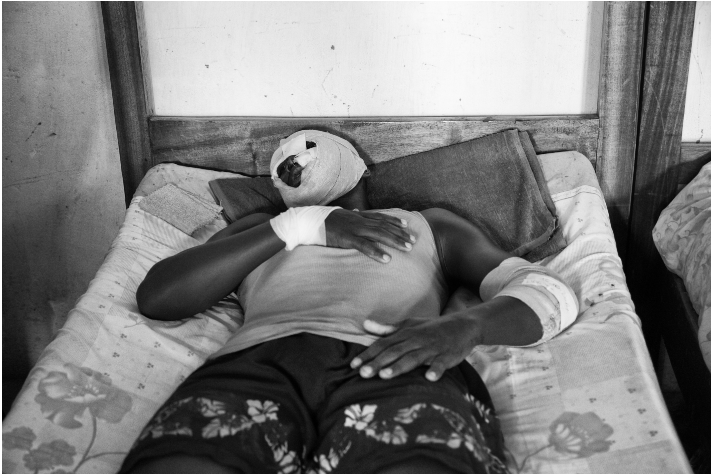
A MINUSCA's FPU policeman, was injured during the civil unrest of October 2014 in Bangui, Central African Republic.