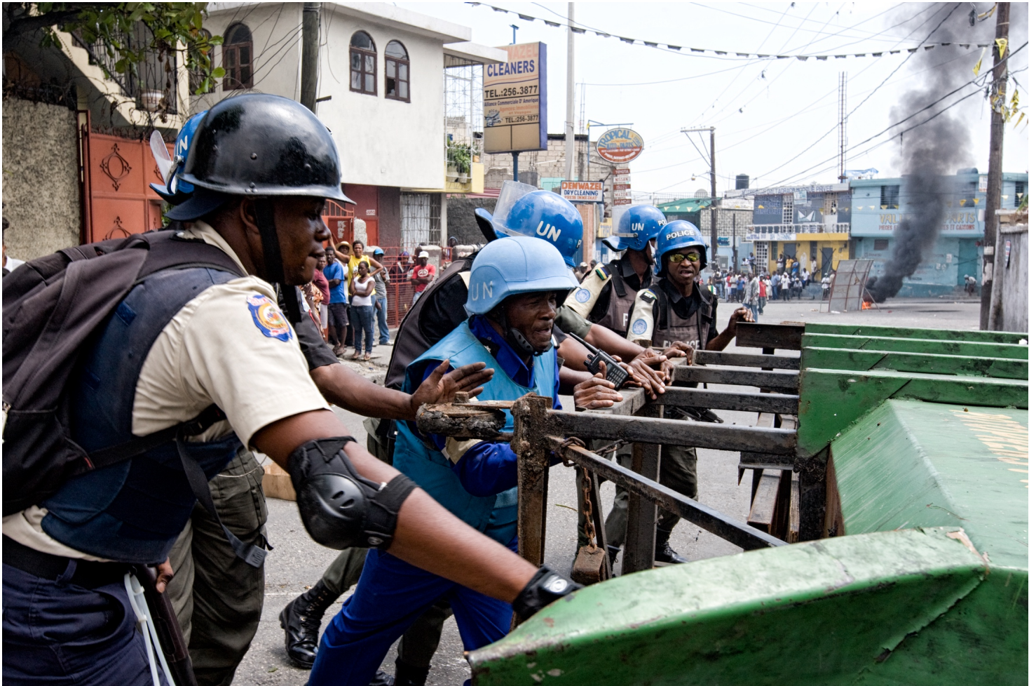
UN peacekeepers clear the road in Port-au-Prince, Haiti, after three days of heavy demonstrations over the high price of food.