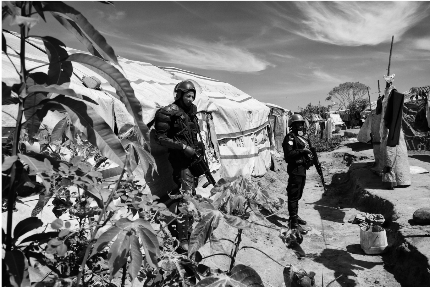
Female members of the Rwandan FPU3 team which consists of 160 members and 50% of whom are women, currently serving in South Sudan, patrolling inside the protection of civilian camp (PoC3) in Juba. Here they provide support for a visit of fellow UN officers to vulnerable women and children living in the PoC.