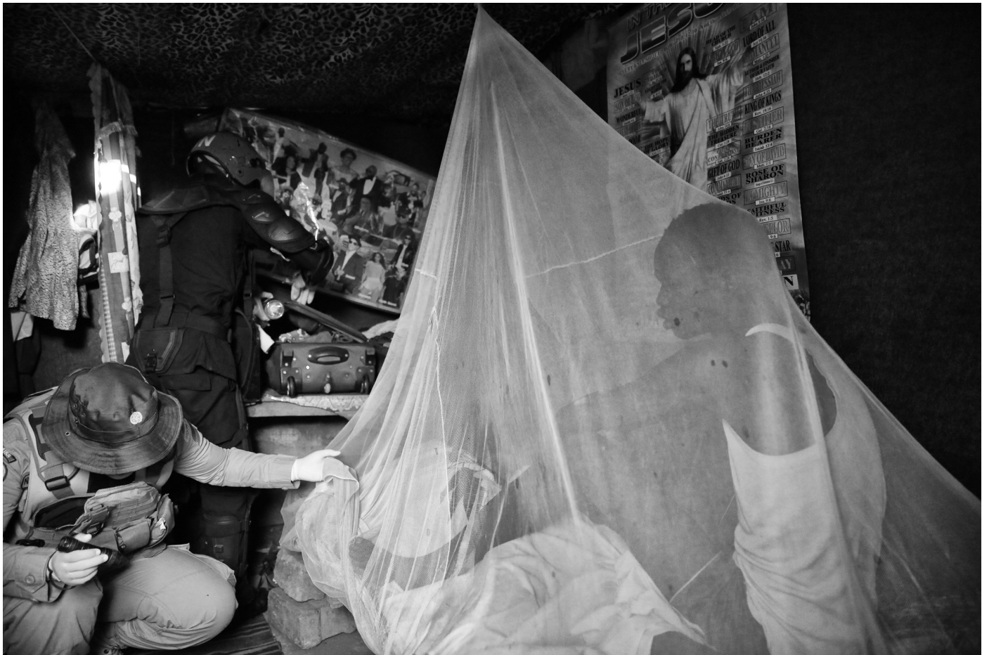
An Indonesian female UNPOL together with a Rwandan FPU member are conducting a search operation in PoC3 in Juba. Search operations are routine operations conducted at least once a month to ensure that no weapons or any other dangerous items are kept inside the protection of civilians camp.