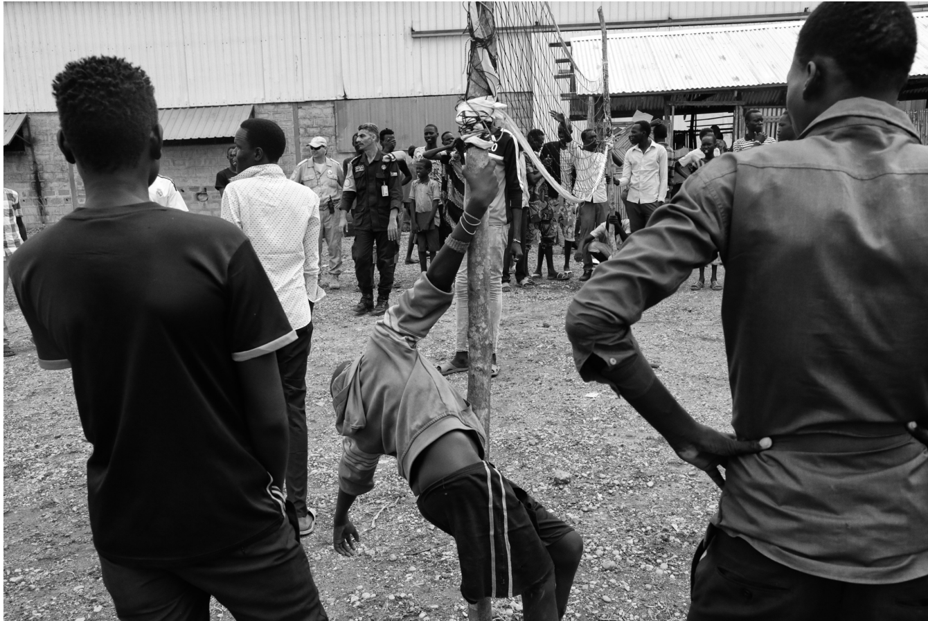
A Jordanian UNPOL officer serving in UNMISS, plays volleyball with displaced people who moved from PoC3 to Mangateen camp near the centre of Juba.