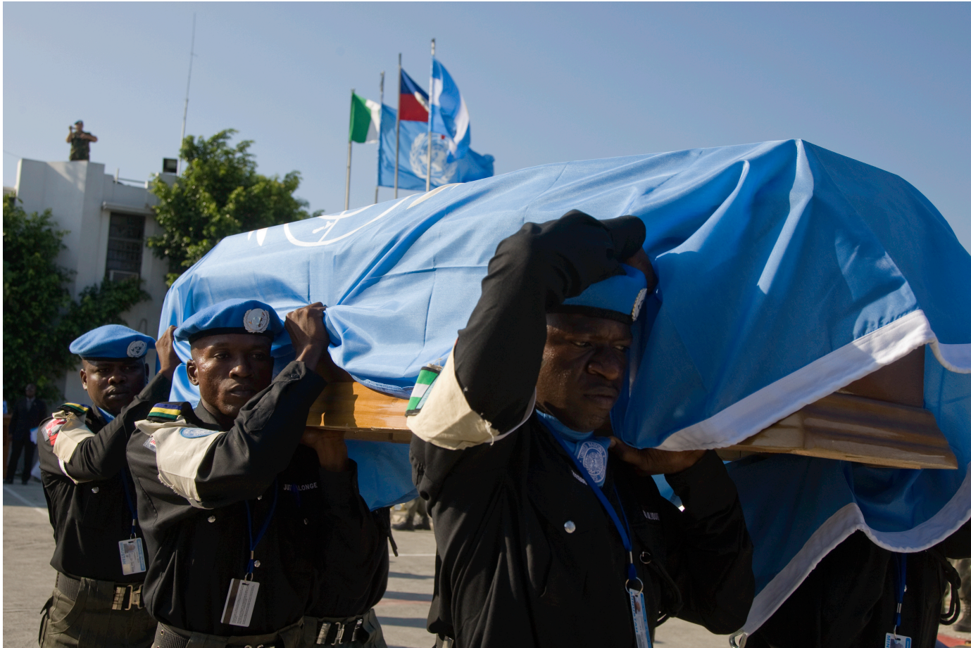
Nigerian FPU serving in Haiti hold a ceremony for a fallen UNPOL Officer in Port-au-Prince