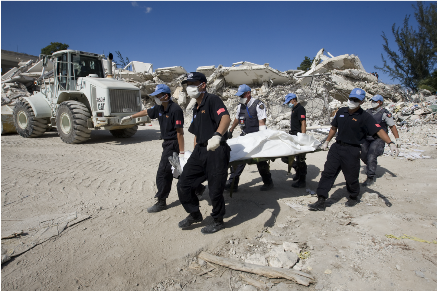
Chinese FPU search and rescue team work through the rubble of the United Nations mission in Haiti's headquarters. Port au Prince, Haiti was rocked by a devastating earthquake on Tuesday January 12, 2010 killing thousands