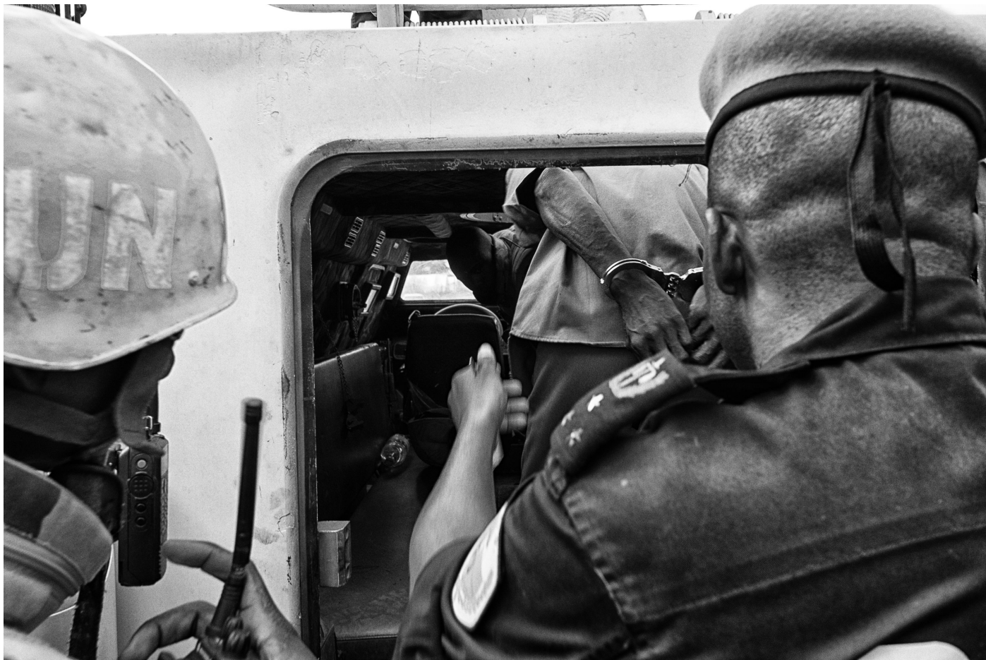
Members of MINUSCA's UNPOL have arrested a alleged war lord.