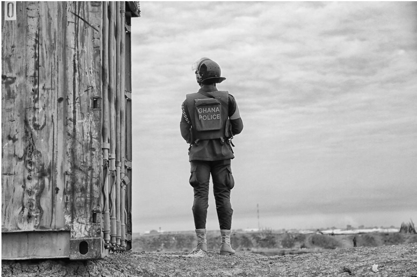
An UNPOL officer from Ghana, in Bentiu's protection of civilian camp.