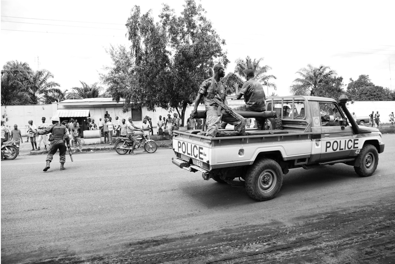
Bangui, Central African Republic, UNPOL members open the road for a red cross vehicle carrying injured members from Bangui's Muslim community.