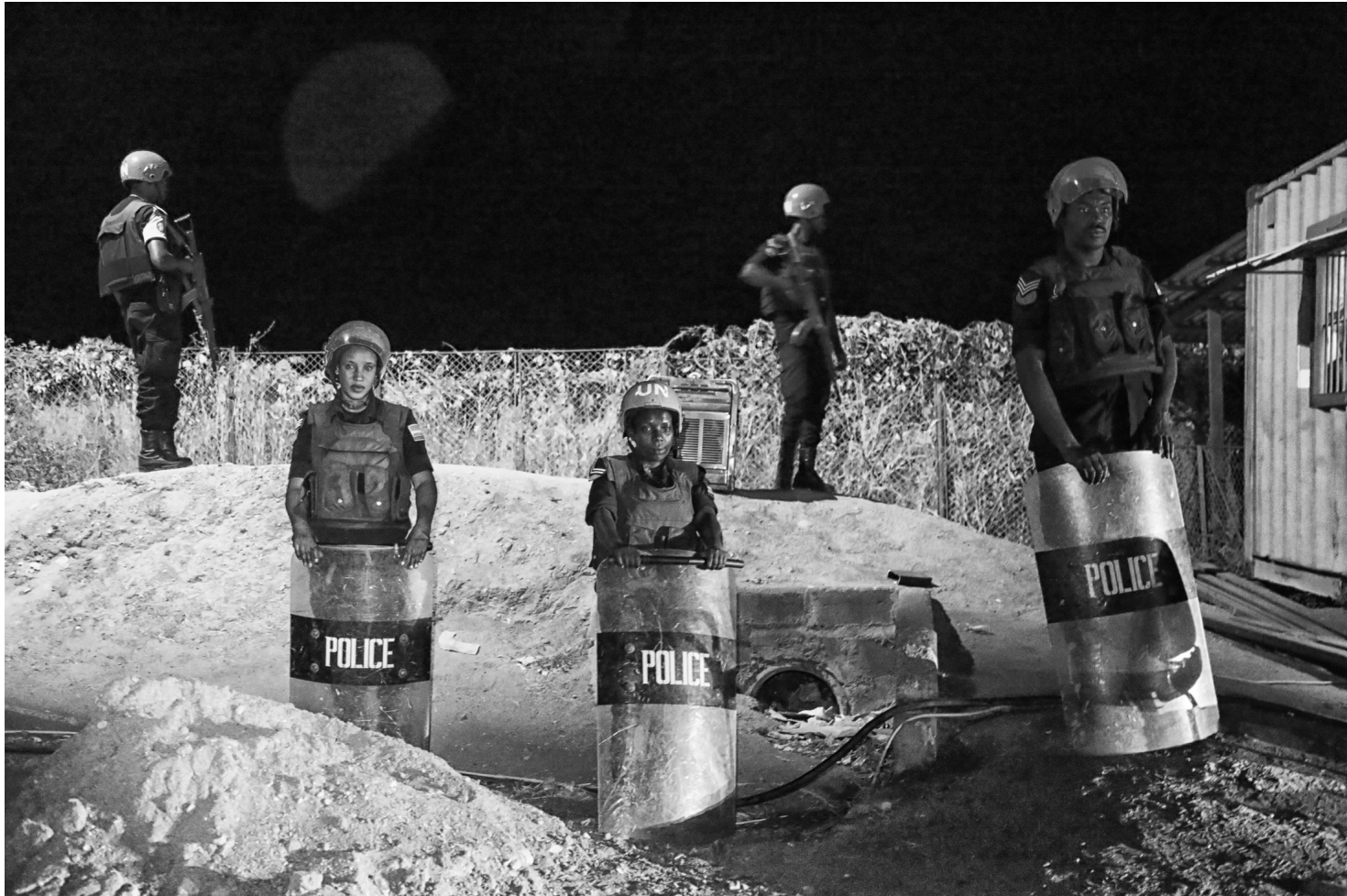
Christmas Eve and Members of the Rwandan FPU serving, in South Sudan, are stationed by the entrance of the protection of civilians camp (PoC3) in Juba.