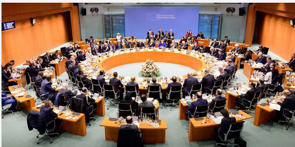
Wide angle view: Hosted by German Chancellor Angela Merkel, the Berlin International Conference on Libya was held on 19 January, 2020 with an objective to facilitate stakeholder dialogue towards ending the conflict in the country.

Additionally, the Contact Group held a virtual meeting on 19 May at which it once again expressed its deep concern about the political deadlock in Libya, the serious deterioration of the security situation in the country and the continuation of fighting between the belligerents to the detriment of the legitimate aspirations of the Libyan people. The Contact Group deplored the deteriorating humanitarian situation in Libya, compounded to the extreme by the Coronavirus pandemic (COVID-19). The Group strongly condemned the numerous violations of the International Humanitarian Law that could constitute war crimes, such as the attacks on hospitals and vital facilities, the persistent indiscriminate bombing of civilian areas and the impediments to humanitarian access.