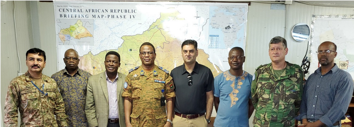
UNOAU and AU representatives meeting with MINUSCA force commander Lieutenant-General Daniel Sidiki Traoré in Bangui, Central African Republic

On May 8, the UNOAU supported the signing of a Memorandum of Understanding (MoU) between the United Nations Multidimensional Integrated Stabilization Mission (MINUSCA) and African Union Observer Mission in the Central African Republic (MOUACA), which specifies the procedures for deployment, safety and security, and logistical support for activities assigned by the African Union Peace and Security Council (AUPSC).