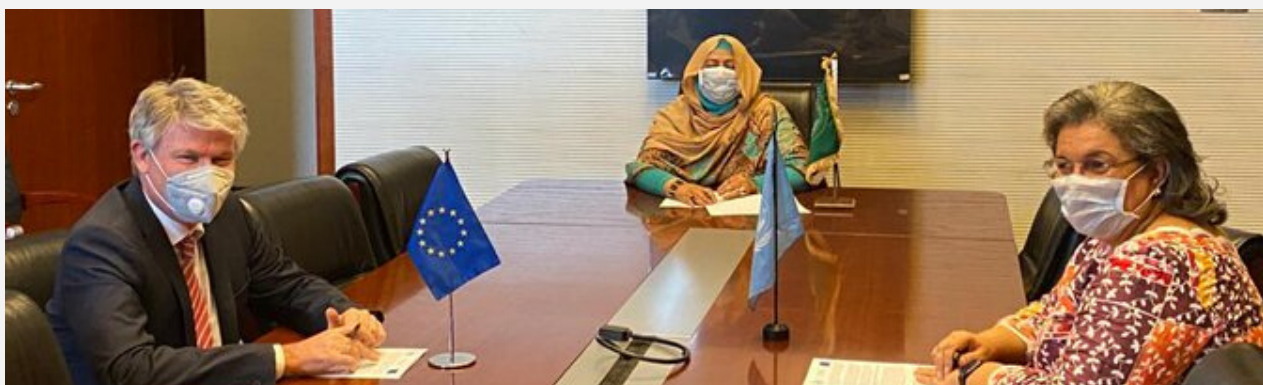
Amira El Fadil, AU Commissioner for Social Affairs (center) signs the Spotlight Initiative Africa with SRSG to the African Union and Head of UNOAU, Hanna Tetteh and Ambassador Ranieri Sabatucci, Head of the European Union Delegation to the African Union

The United Nations (UN), the African Union (AU) and the European Union (EU) signed the three-year Spotlight Initiative Africa Regional Programme on 27 April. The Initiative will work towards the elimination of all forms of violence against women and girls, including harmful practices such as female genital mutilation and child marriage. Funded by the EU, the programme will focus on the strengthening of AU member state legislation and policy processes in the specified areas, the generation of quality and reliable data and support to women's movements and relevant civil society organisations. The design and implementation of the programme is guided by the AU's Agenda 2063, the priorities of the 2030 Agenda for Sustainable Development, as well as other key regional instruments. The UN implementing partners that will work with the AU through the African Union Commission on the Spotlight Initiative Africa Regional Programme are UN Women, the UN Population Fund (UNFPA), the United Nations Children's Fund (UNICEF) and the United Nations Development Programme (UNDP) . Read more